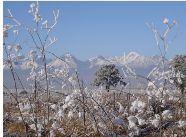
High Tatra in Winter

Article 9 of the Convention refers to policies on sustainable tourism in the Carpathians, which were decisions of the following Conferences of the Parties (COP): The first COP (December 2006) decided to establish a tourism working group to develop a Tourism Protocol and a Tourism Strategy. The second COP (June 2008) decided to continue the work on the Protocol on Tourism and the Tourism Strategy.